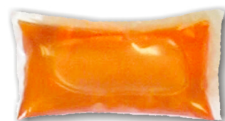
F115 Mop Buckets